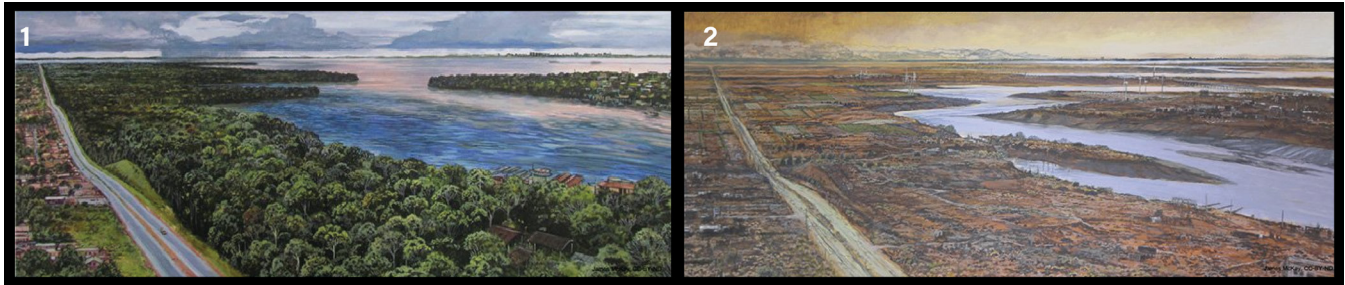
An illustration by James McKay of the Amazon in 2020 (1) and in 2500 (2) under a RCP 6.0 scenario. In 2500, forest cover may be largely gone, with reduced surface water levels. In addition, human presence and infrastructure may be minimal, degraded, or absent, given high temperatures and water stress. Creative Commons Attribution License