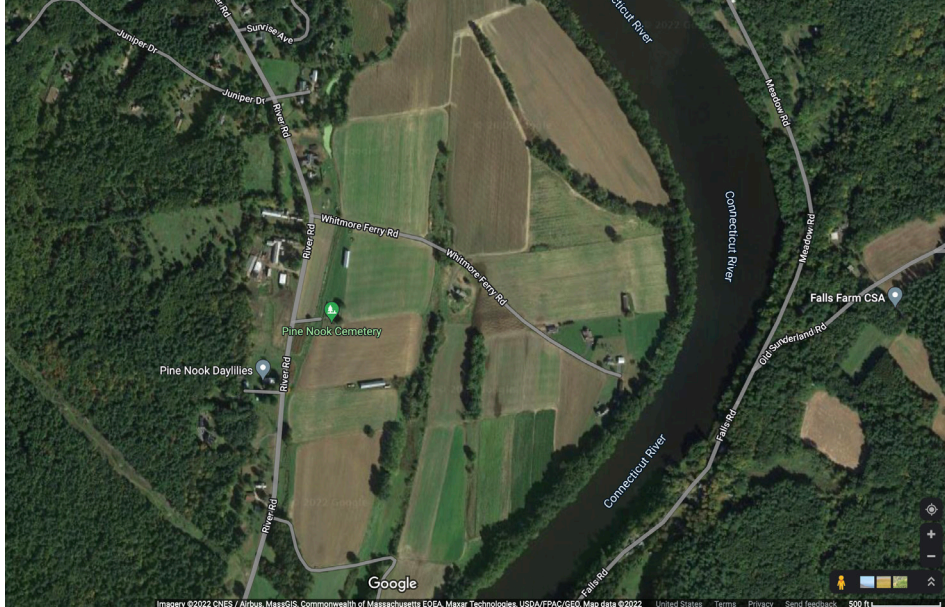
Riverside Farmland in New England.