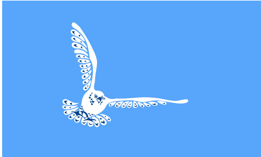
Flag of the Inuvialuit tribe of the Western Canadian Arctic. Open source via Wikimedia Commons.